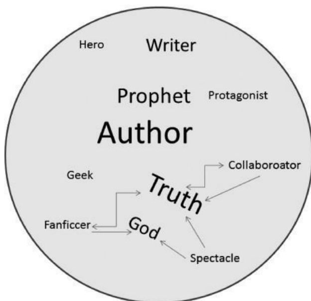
Fig. 2: Fandom's reconstruction of authorship.