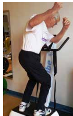
Fig. 5. Elderly patient training upper spinal rotation or his golf swing.

The mechanism of upward thrust during WBVT and increased G-loading, increases muscle work during movements, and are