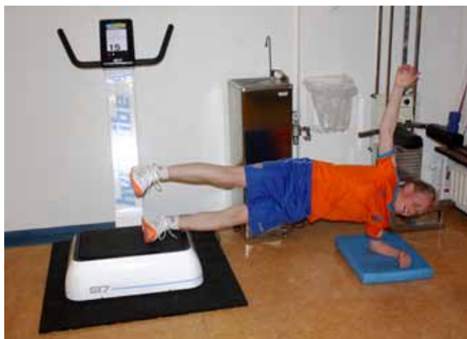
Fig. 4. Side-plank with stimulation of latera hip and ankle.

actually affect muscle and bone tissue. It may be based through similar physiological effects on bone morphogenetic proteins as extracorporeal shock waves [23] or low-level pulsed ultrasound, [24] stimulating healing in non-unions. If just the low load high frequency stimulation, has effects on the bone strength and healing process, it is of importance in rehab, since osteoporosis or loss of BMD of the lower extremity is common. This can be from immobilisation and casting or use of corticosteroids. As bone contusions are a serious part of many injuries, all treatments affecting the bone metabolism, as well as of the tendons, are worth attention. As there are definitely positive results on bone strength and architecture in animal studies, WBVT is an exciting field, adding to treatments of stress fractures and bone pathogenesis and insertional tendinopathies, for example of the lower leg and patella. Similarly WBVT may be an option in treatments apophysis like OS, Sever's and Sinding-Larsen disease.