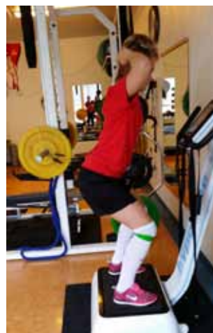
Fig. 2 Isometrics and squatting with hip external rotation stimulatoin in case of knee instability.

Modern vibration machines are based on research from the early 1960s, when rhythmic neuromuscular stimulation (RNS) was described. These studies showed that cyclic vibrations, could improve the condition of damaged joints by creating a quick stretch, followed by relaxation [13] . It is thought that vibration elicits changes through physiological adaptations to accommodate the vibratory waves [9, 14, 15] and by stimulation of neuromuscular pathways [16] .