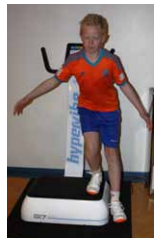
Fig. 3 Single leg squat – side step downs.

Stimulating the primary endings of the muscle spindle (Ia afferent), will excite the motor-neurons, causing contraction of homonymous motor units. This results in a tonic vibration reflex, which can improve maximum voluntary contraction of muscles, especially when used in conjunction with a standard strength training program [17] . Other research has hypothesised that these improvements are due to motor-unit synchronization and the recruitment of previously inactive motor-units. [18]