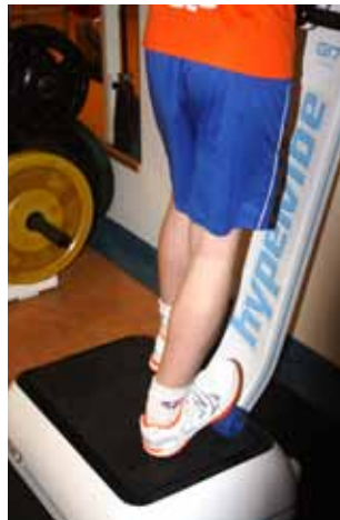
Fig. 7. Ankle mobility training on WBV platform.

nervous system. Bautmans [52] reported a significant increase in lower body flexibility in a nursing home residents and Kumari et al. [53] reported significant increase in hamstrings flexibility in RA patients. A 13% increase in flexibility of female athletes has also been reported. [54] The immediate increase in flexibility from WBVT persisted for at least 15 minutes, without altering jumping performance, irrespective of frequency and amplitude. [55] Others have found similar small effect on knee ROM in combination with stretching, [56] indicating, mobility exercises during vibration, to be a good addition to the physical therapist's toolbox (Fig.7)